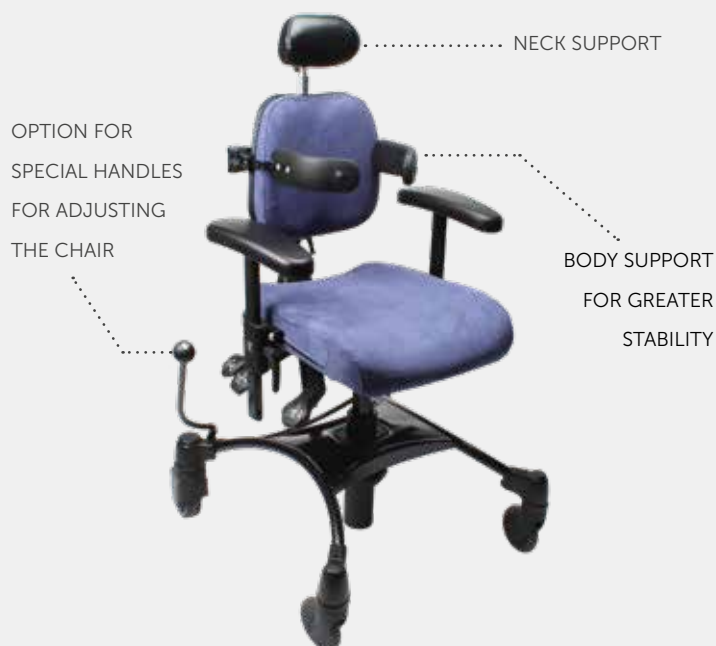
Examples of accessories for VELA Tango 100S

A complete list of accessories is available at www.vela.eu .