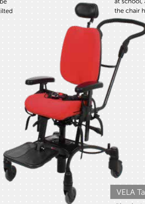
VELA Tango 100S

VELA Tango 100S with a push handle is suitable for children who use the chair in different places, for example at school, and require support when the chair has to be moved.