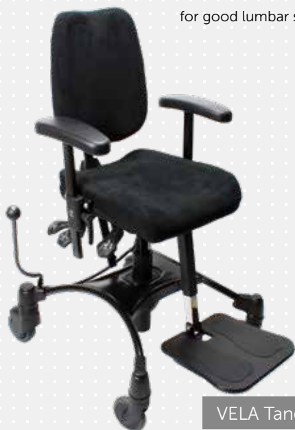
VELA Tango 100S

VELA Tango 100S is supplied as standard with a seat featuring a cavity with foam panels that can be reversed or changed, optimising sitting support for the child. The backrest is height adjustable and can be moved forwards and backwards and tilted for good lumbar support.