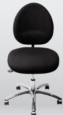
VELA Latin 200