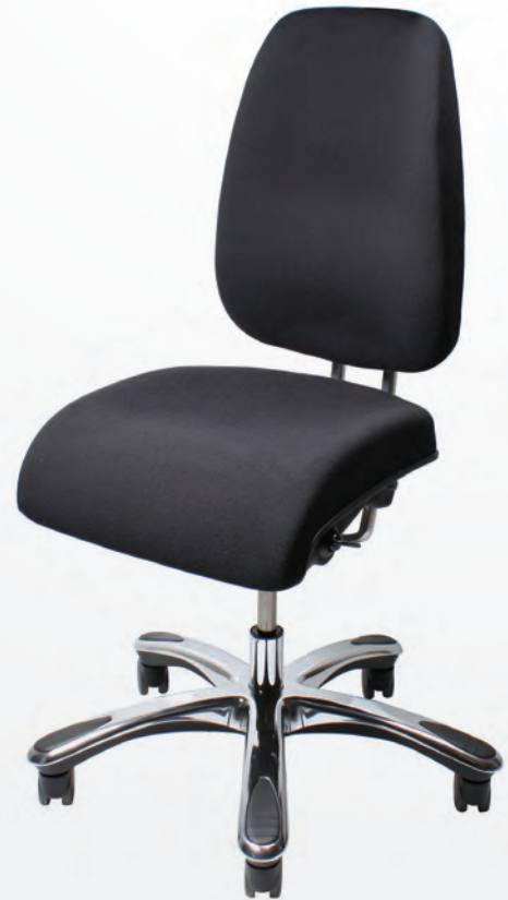
VELA Latin 400

VELA Latin is a quality product, built on extensive knowledge and experience of the design and manufacture of ergonomic chairs. VELA Latin chairs have been tested and approved, and they comply with all applicable requirements and standards.