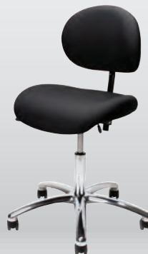
VELA Latin 100