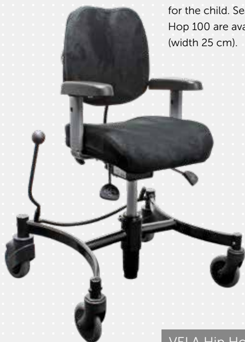
VELA Hip Hop 100

VELA Hip Hop 100 is also available with a footplate. Enabling a child to have their feet on the "floor" helps them to remain still in a sitting position and offers greater safety, as the child cannot rock the chair.