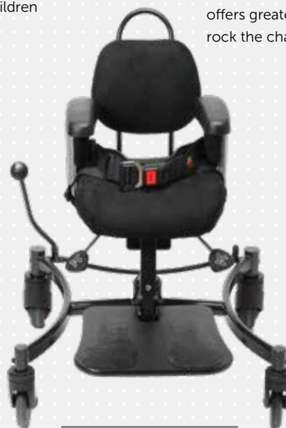
VELA Hip Hop 100