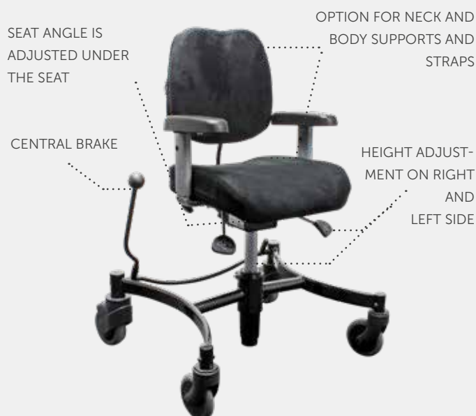
Examples of features on VELA Hip Hop 100

A complete list of accessories is available at www.vela.eu .