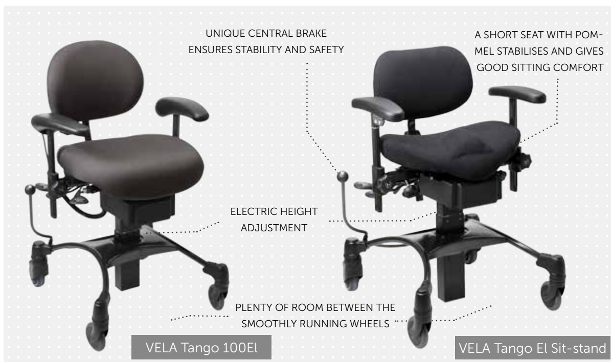
VELA Tango 100El

THE ARTHRITIS-SWITCH FOR ELECTRICAL HEIGHT ADJUSTMENT